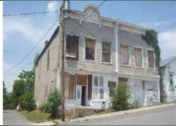
Verbena Lodge Building 121 Pennsylvania Avenue